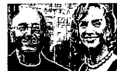
Photo Gallery With A.L. Gordon Was your photo taken at the San Francisco Ballet at Lincoln Center? View Photos...